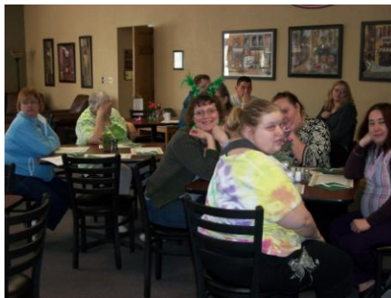
St. Patrick's Day Luncheon