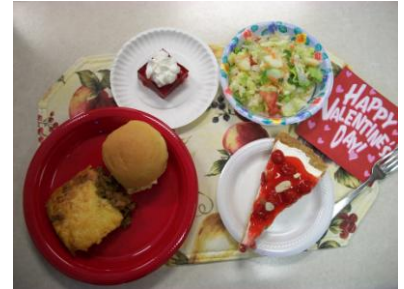
St. Valentine's Luncheon