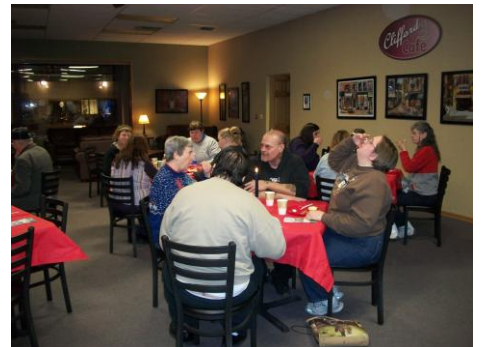
Snowflake Candlelight Dinner Jan. 2010