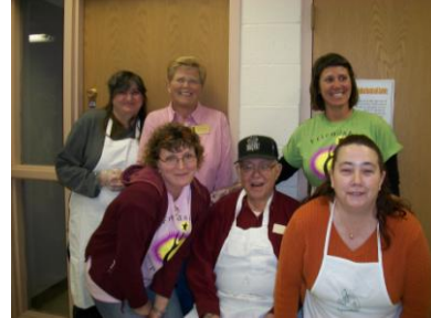
Serving lunch at St. Paul's Community Table