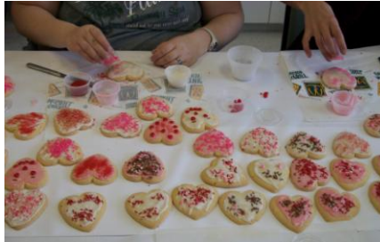
Staff, members and FVTC nursing students decorate cookies for St. Paul's and St. Thomas Churches' Community Table