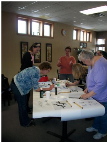
Japanese writing lessons in preparation of the Shidara drum performance at the Fox Cities PAC on March 5, 2010