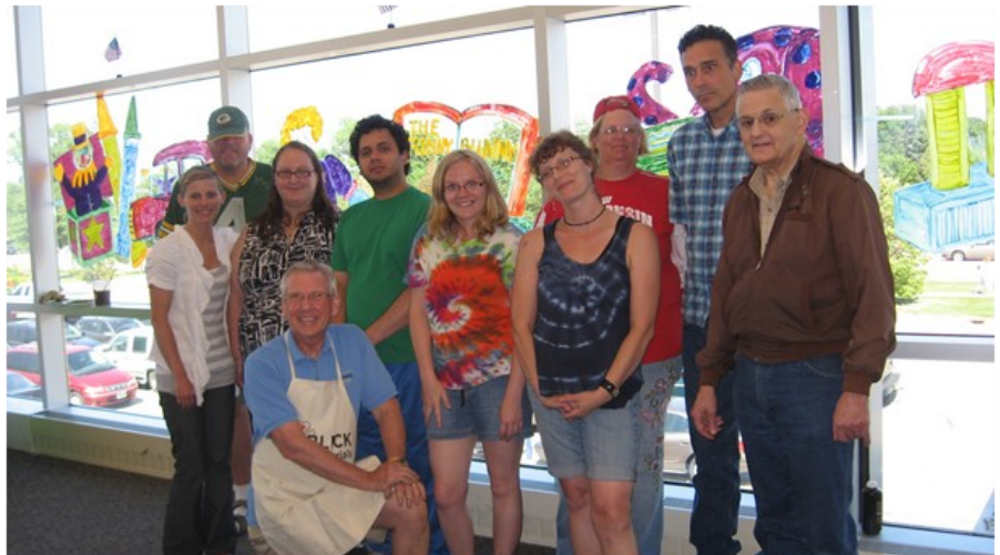
Children's Hospital of WI-Fox Valley